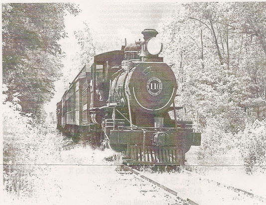
The Little River Railroad, Coldwater, Michigan

Montgomery Wards lathe that was made by Logan. It is a 10" throw lathe with a 42" long bed that can handle project lengths up to 30". There are several different gears that can be used to cut threads or adjust automatic feed speeds. The lathe is belt driven and has three different speeds. I would be happy to show it to anyone who wants to see it, and will try to answer any questions that I can. Asking $ 400.