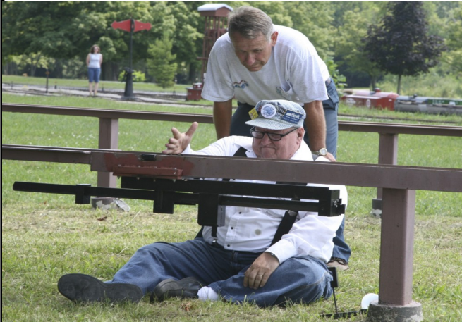
Checking out the Scales operation.