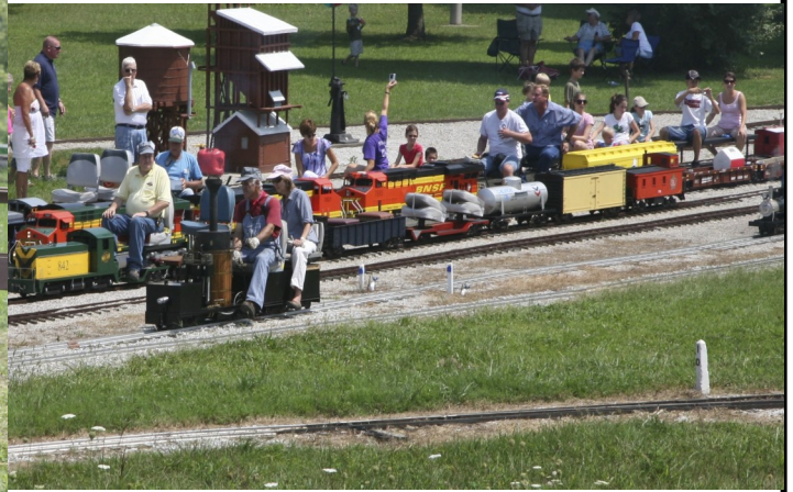
The Parade of trains Saturday