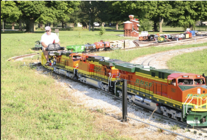
The Big Locos require large haulers to move from track to track.