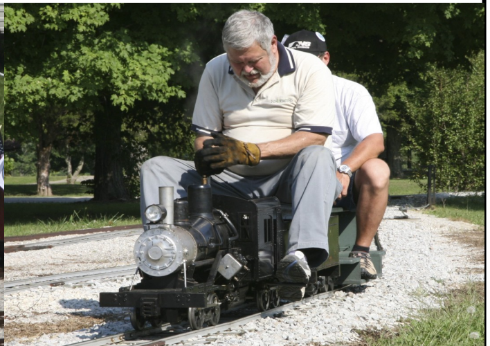
The Small locomotives will fit in vans and small pickups.